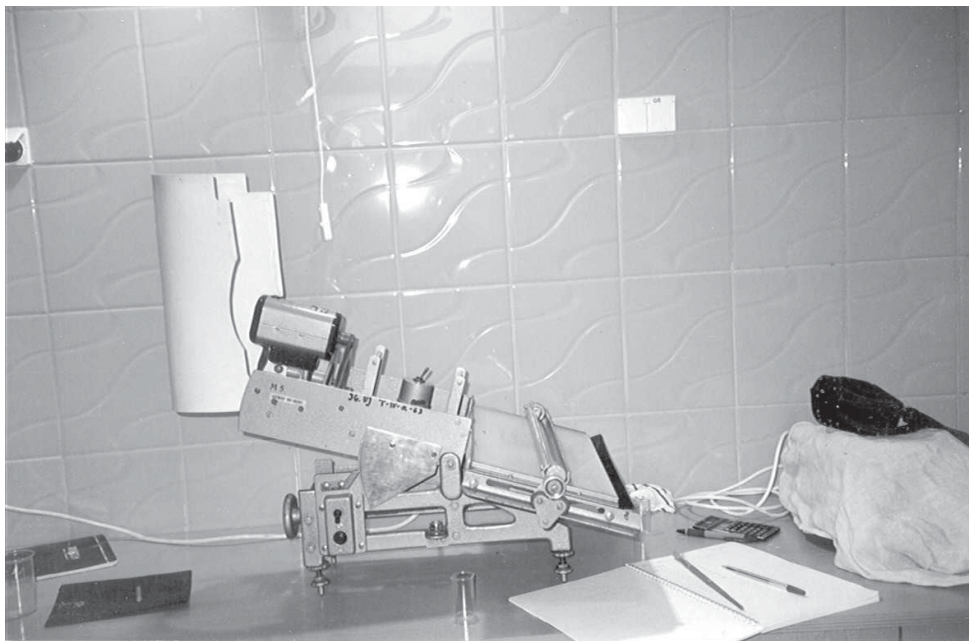
Fig. 2. The view of unique mechanical graniformameter used for determining the abrasion of eolian sand grains (photo by B. Izmailov), created in 1964 by B. Krygowski.

The form of grains is one of the most difficult properties of deposits to define. Methods used to examine the rounding of the grains depend on their size. Determination of the degree of abrasion of grains of the sandy fraction is attained using several methods. One of them is mechanical graniformametry (Fig.2).