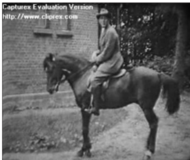
Fig. 8. A horse is demonstrated in the Plungė stud farm, 1929