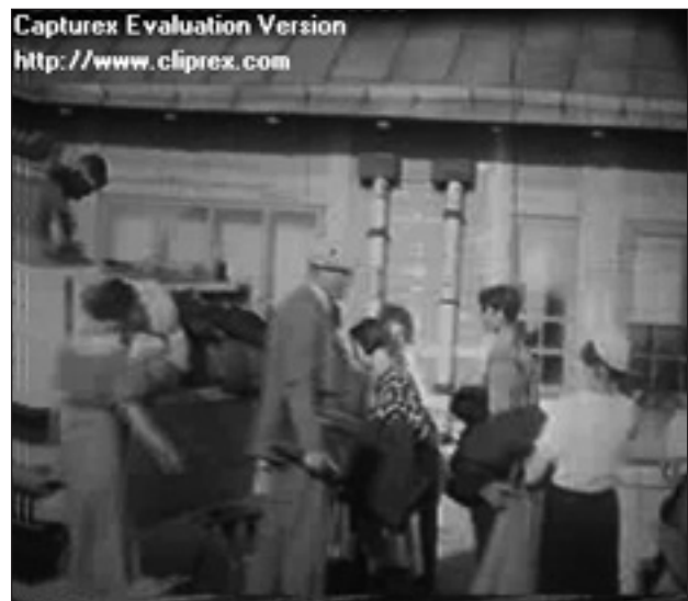
Fig. 12. P. B. Šivickis (the tallest one with a briefcase in his right hand) is supervising the loading of expedition impedimenta at the Kretinga railway station, 1935

This group of films also includes a sequence related with scientists: images from the hydrobiological expedition to the Šventoji Port. It is known that this expedition was organized by P. B. Šivickis in the summers of 1934 and 1935 (Petrauskas, 1980). Yet judging by the arrangement of frames the sequence had to be filmed in 1935 because it is known for certain that the previous sequence at M. Sleževičius' house was filmed in 1935. The sequence begins near the Kretinga railway station with the visible sign "Kretinga" (Kretinga Station) on the building. Students are loading the expedition inventory under P. B. Šivickis' supervision (Fig. 12). The words "Šventosios uostas" (the Šventoji Port) are stencilled in capital letters on the truck side implying that the truck was port property. This is the third and last episode with P. B. Šivickis himself. From the historical point of view these films are priceless because P. B. Šivickis has never been captured in any other documentary film. As was mentioned above (Petrauskienė, 2006, 2008, 2011; Petrauskienė, Olechnovičienė, 2011), P. B. Šivickis was regarded as disloyal to the Soviet Government therefore no attempts were made to promote his scientific achievements or to immortalize him in filmed material. For comparison it can be pointed out that a three-hour long documentary film made by professionals was devoted to P. B. Šivickis' contemporary Prof. Tadas Ivanauskas.