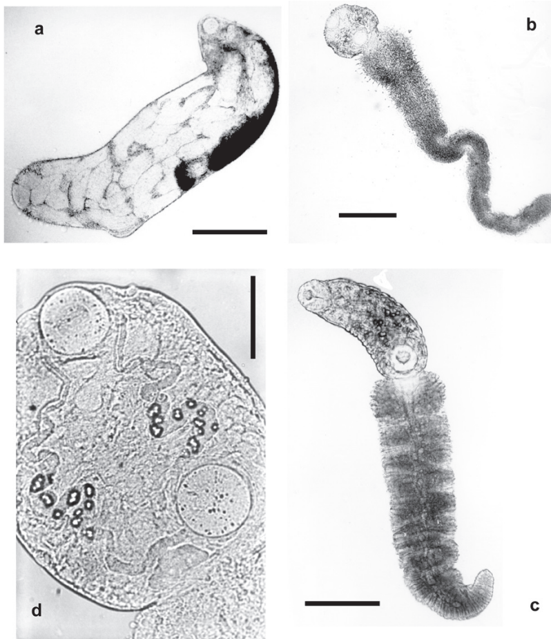
Fig. 1. Morphology of redia and cercaria Echinochasmus sp.: a – redia of Echinochasmus sp. from naturally infected Lithoglyphus naticoides , b–d – fully developed cercaria of Echinochasmus sp. with contracted body (b) and contracted tail (c), cercarial body (d). Scale bars: a – 0.1 mm, b – 0.2 mm; c – 0.1 mm; d – 0.05 mm