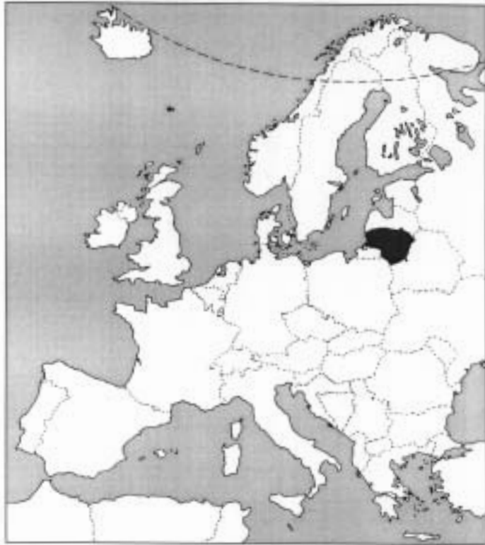
Fig. 1. Geographical situation of Lithuania in Europe.